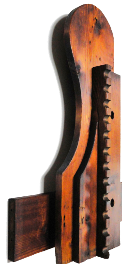
5. The finished assemblage.