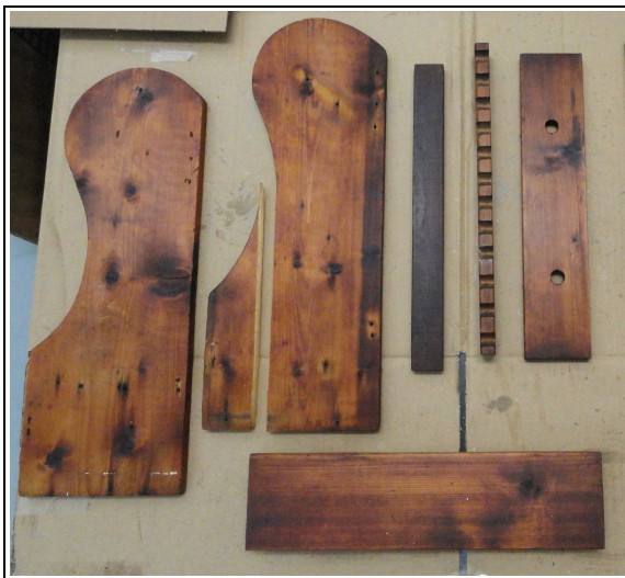
3. Each piece is cleaned, oiled, and dried.