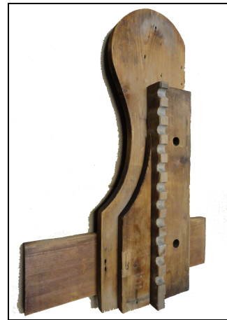
2. Conceptual layout.