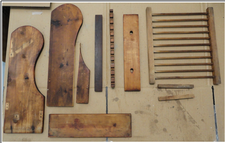
1. Discarded wood magazine rack is disassembled.